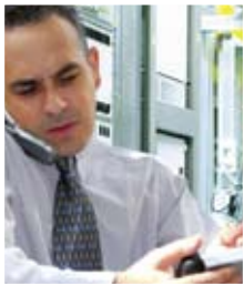
PegInspect PDA & Web-based Inspection