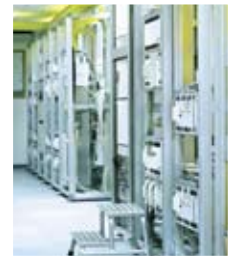
Cleanroom & Data Center Cleaning