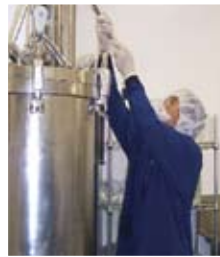
Critical Environment Cleaning & Decontamination