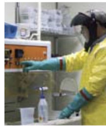
Bio-Technology Cleaning & Decontamination